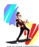
AIR GUITAR COMPETITION