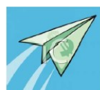
PAPER PLANE COMPETITION

TRANGIE ACTION GROUP SHOP 'n' WIN SATURDAY 12 TH DECEMBER 2015 6:30PM TRANGIE BOWLING CLUB