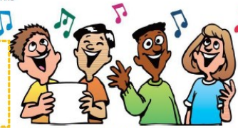
SING AUSTRALIA, ST JOHNS SCHOOL AND TRANGIE CENTRAL SCHOOL

4 x $250 Local shopping vouchers 1 x $750 Local shopping vouchers