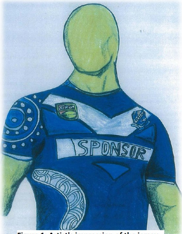
Figure 1: Artist's impression of the jersey

For a minimum donation of $75 your business or family name could be on the front, back or sleeve of the jumper. The position of your logo/name will be determined by a Calcutta style draw. These jerseys will be used for many years to come.