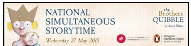
PHOTO of the WEEK

Kinder students doing their Literacy for the day.