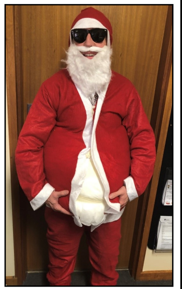
Teach your children well