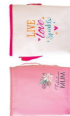
Cooler Bag $5