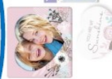
Carry All $5