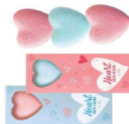
Bath Bombs $3