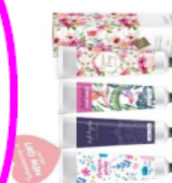
Hand Cream $3