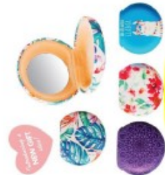
Jewellery Case $4