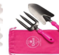
Garden Set $5