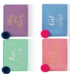
Carry All $5