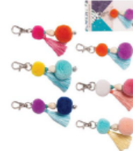
Key Ring $3